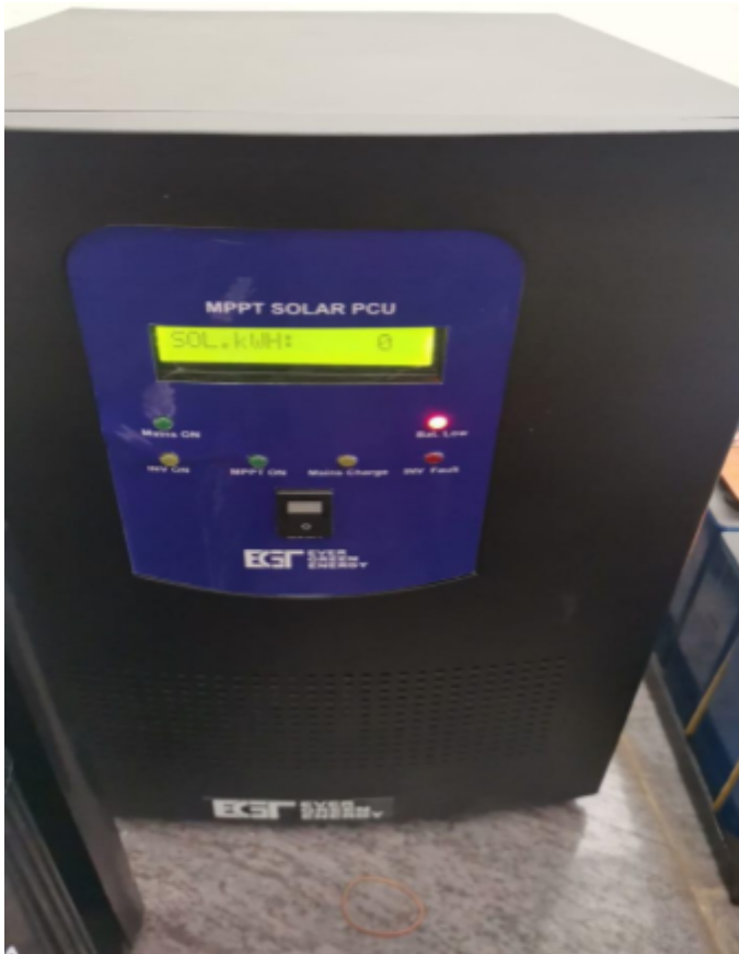
Fig 2.2 PCU

A PCU (Power Conditioning Unit) is an essential component of a solar PV system that helps manage the power flow and ensure optimal utilization of the generated electricity. Let's break down the characteristics of a 1.5 KVA, 24V, 80Ah, 660W PCU. 1.5 KVA: KVA stands for kilovolt-ampere and is a unit of apparent power. In this case, the PCU has a capacity of 1.5 KVA, meaning it can handle a maximum power load of 1.5 kilovolt-amperes. This specification indicates the capacity of the PCU to handle the electrical load requirements of the connected devices or appliances. 24V: The PCU operates at a voltage level of 24 volts. This specification indicates the DC voltage level at which the PCU functions