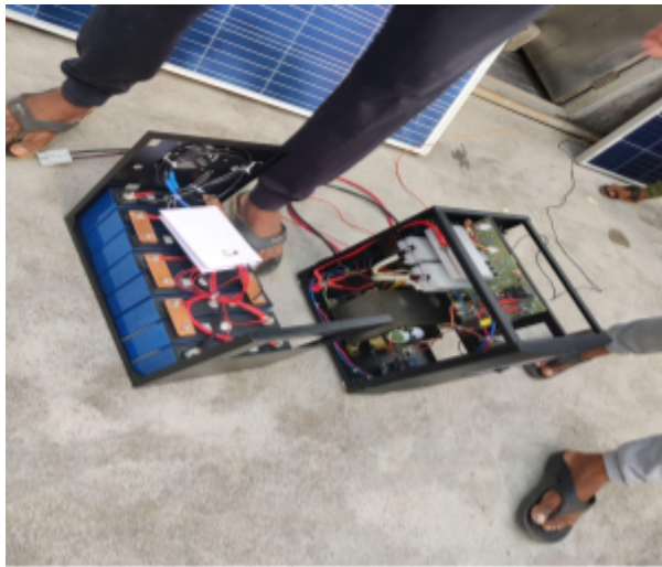
Fig 2.3 LiFepO4 Battery

A 24V 80Ah LiFePO 4 (Lithium Iron Phosphate) battery is a versatile and high-performance energy storage solution commonly used in solar PV systems. With a nominal voltage of 24 volts, this battery is compatible with a range of electrical systems and can effectively store and supply energy. The 80Ah capacity of the LiFePO 4 battery indicates its ability to deliver a continuous current of 80 amps for one hour or a proportionate current over a longer duration.