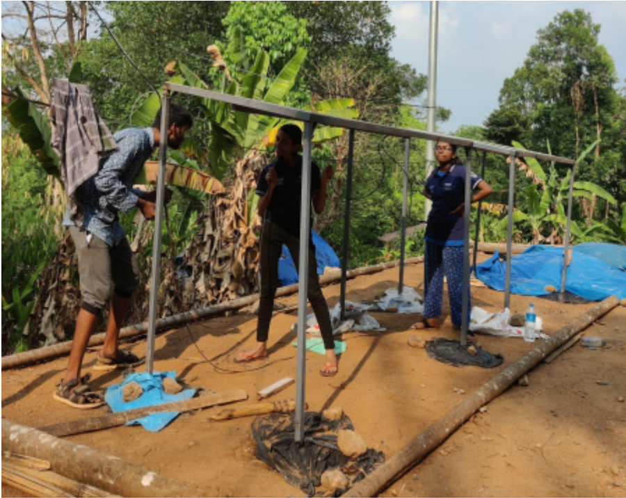
Fig 2.1 Solar Panel

A monocrystalline 330W solar panel is a highly efficient and visually appealing photovoltaic panel. It is constructed using monocrystalline silicon cells, which are derived from a single crystal structure, resulting in a uniform appearance with a sleek black color. With an efficiency rating of around 18% to 20%, these panels can